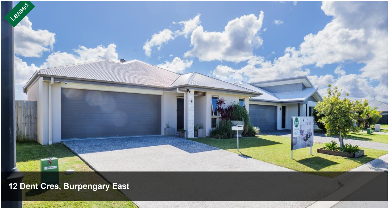
12 Dent Cres, Burpengary East