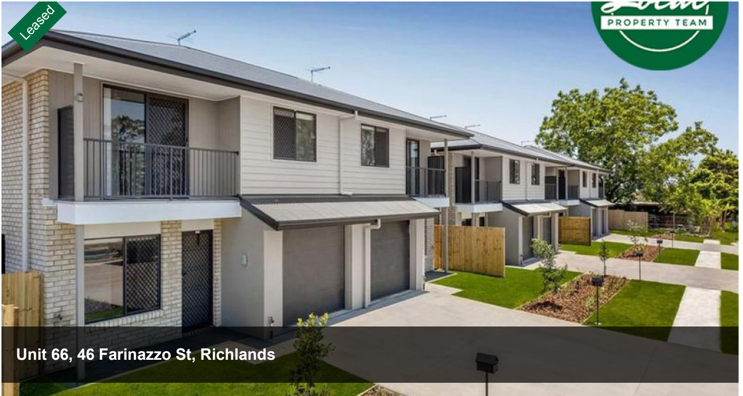
Unit 66, 46 Farinazzo St, Richlands