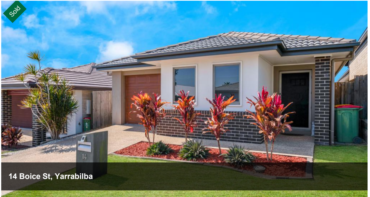
14 Boice St, Yarrabilba