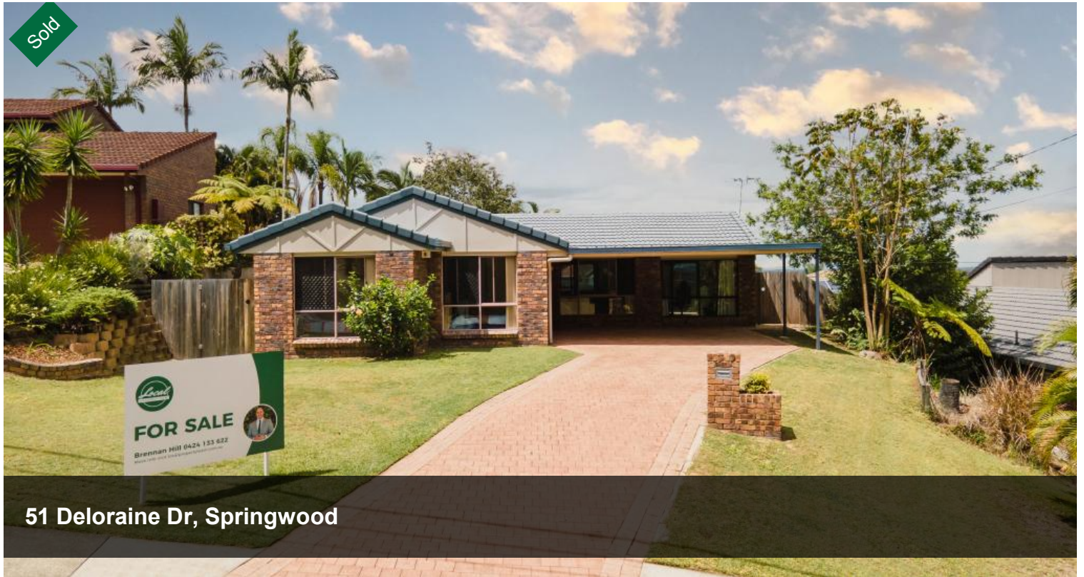
51 Deloraine Dr, Springwood