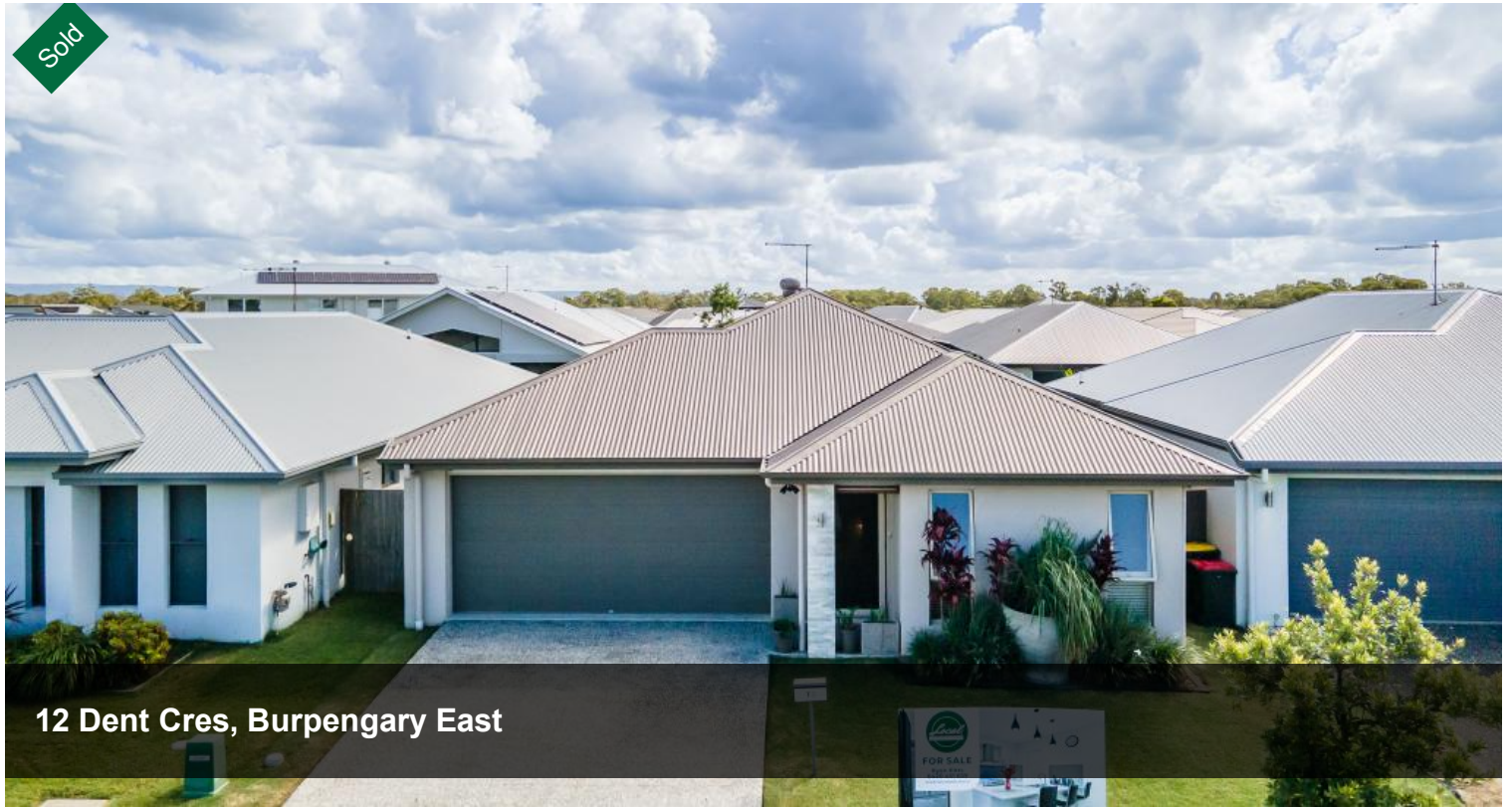
12 Dent Cres, Burpengary East